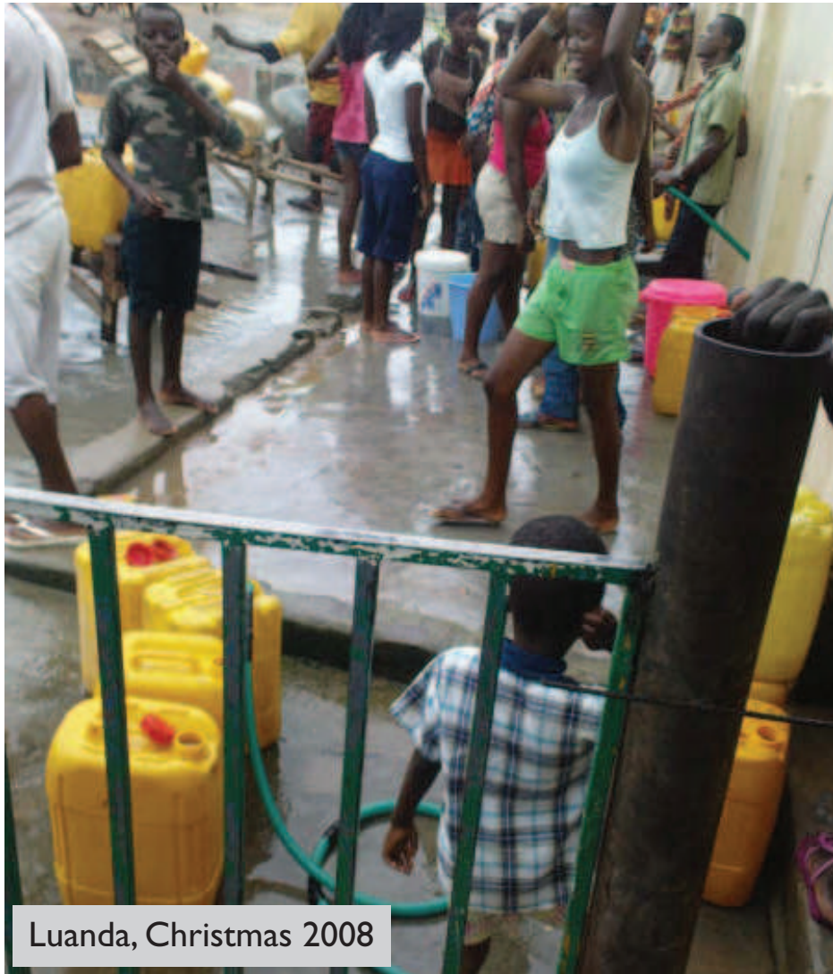
Luanda, Christmas 2008

Sufficient clean water is foundational for all community development. Lack of water and sanitation is an obstacle to education for children across the world, leading to hundreds of millions of lost school days each year. Safe water is necessary for economic growth and to reach the Millennium Development Goals. Lack of access to clean water perpetuates cycles of disadvantage, which affect millions of people, with illnesses and lost educational opportunities during childhood leading to poverty in adulthood.